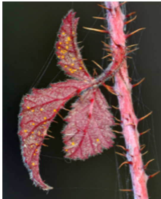
Blackberry leaf showing rust fungus Valley View Trail - taken 27 Nov. 2022