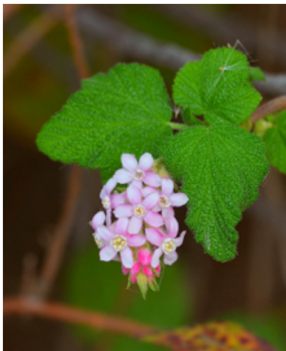
Early blooming pink flowering currant Valley View Trail - taken 27 Nov. 2022