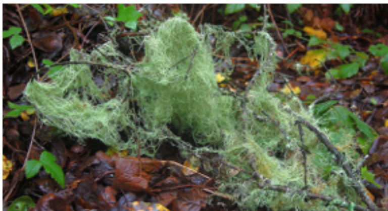
Lace lichen blown down from live oak during rainstorm - Hazelnut Trail