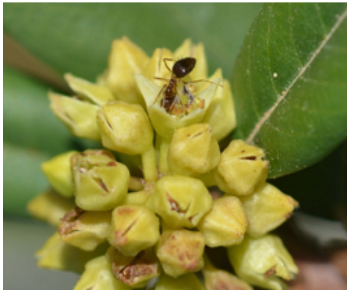
Ant foraging on coffeeberry blossom Montara Mtn Trail - taken 30 Nov. 2022