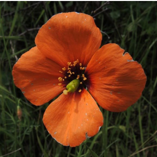
(Photo above of wind poppy, Papaver heterophyllum , by Jorg Fleige)

Jorg is always seeking prime photos of the flowers of the Bay Area (Please note 2 of his photos here); Mimi is looking to present things more powerfully to you, and I think you will see the difference in their new floristic program scheduled for Saturday, February 13, 2016 at 3pm in our Visitor Center.