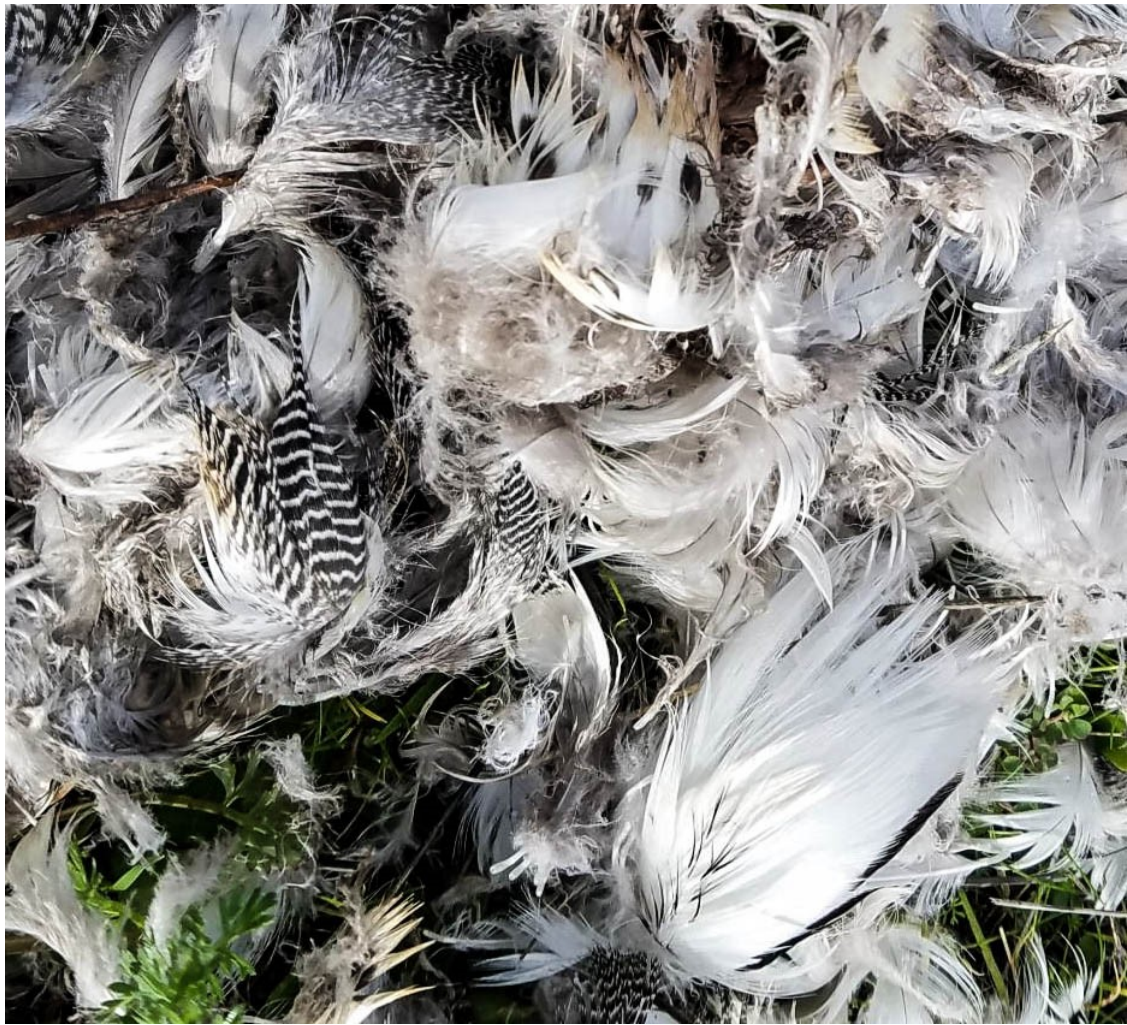
MAYBE A COYOTE’S QUAIL AL FRESCO?