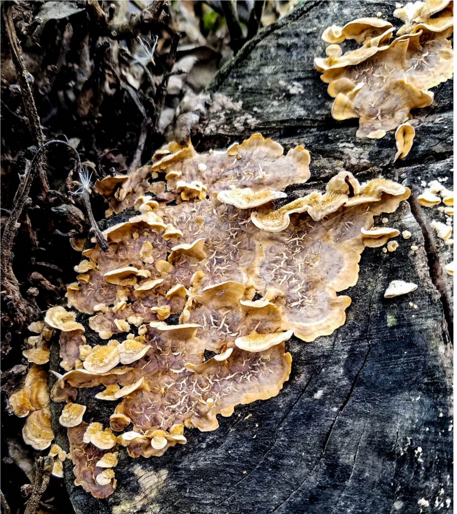
Seed plumes of coyote brush and dandelion dropping into an unknown fungus on Jan. 27, 2019; Weiler Ranch Rd.