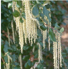
Internet photo of male