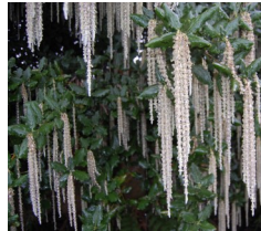
Internet photo of female