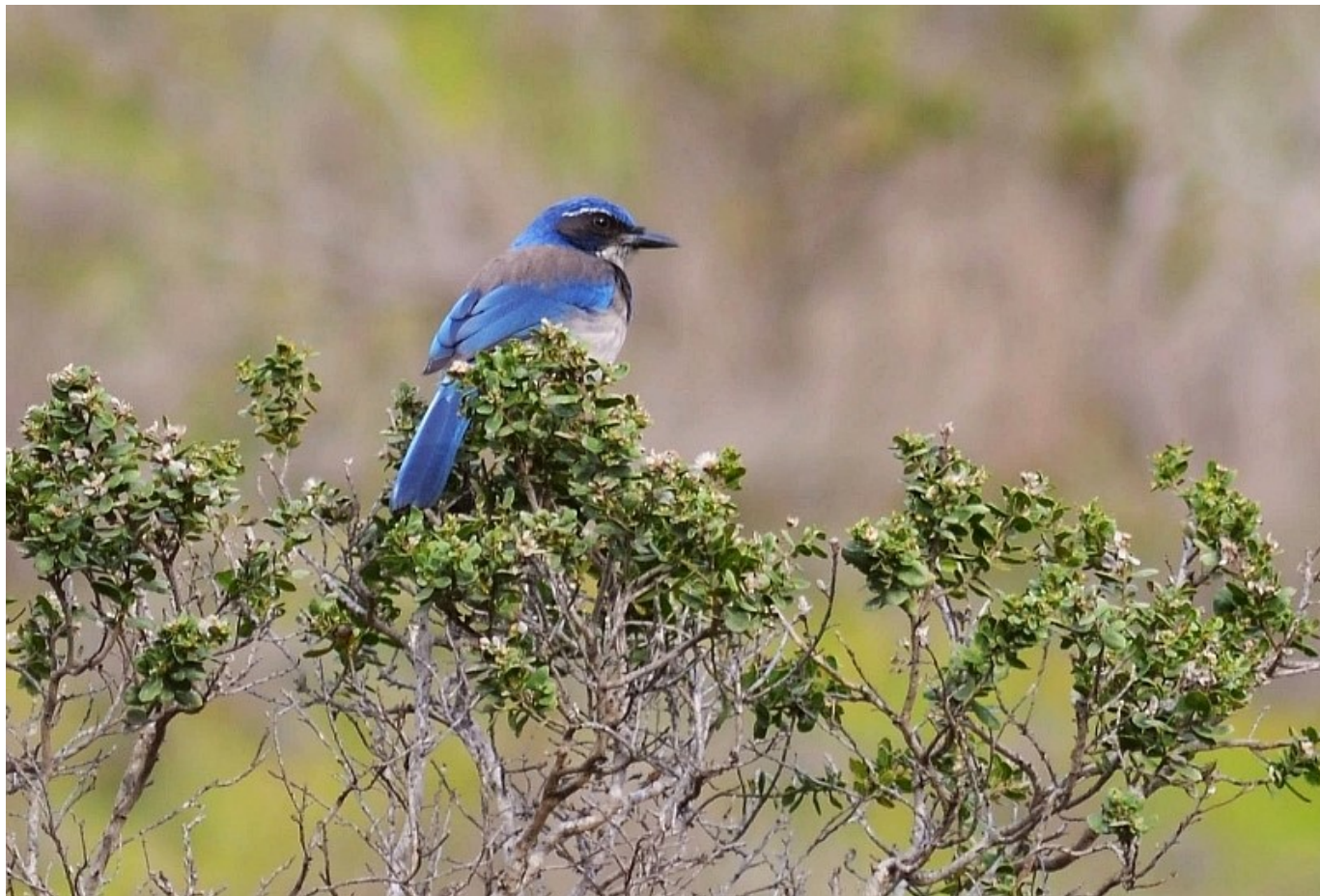
Weiler Ranch Rd. on the 13th of January, 2019